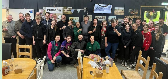
The 2023 Christmas Team at Franklins

hope you all enjoyed your festive meat and goodies.